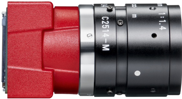
Model without hardware options